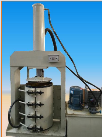
75-C Press Pump for 55 gallon drums